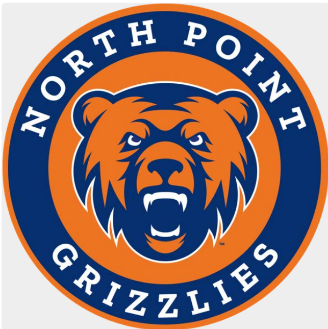
North Point Athletic Calendar